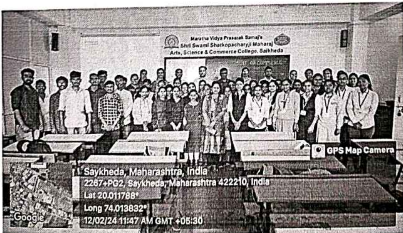
Photograph's With Resource Person & Student here by Commerce Staff