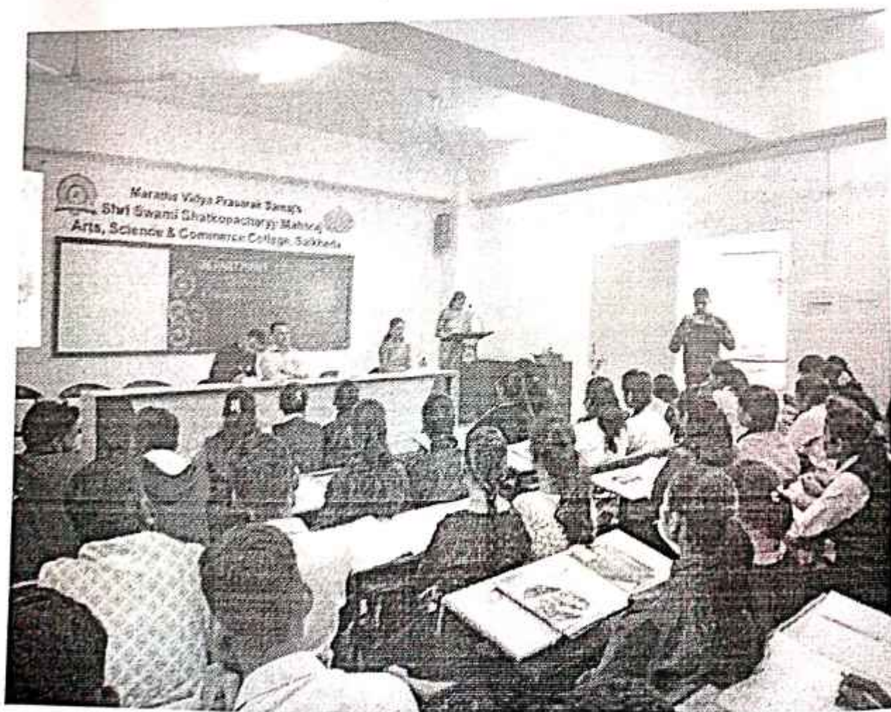
Introduction of Programme