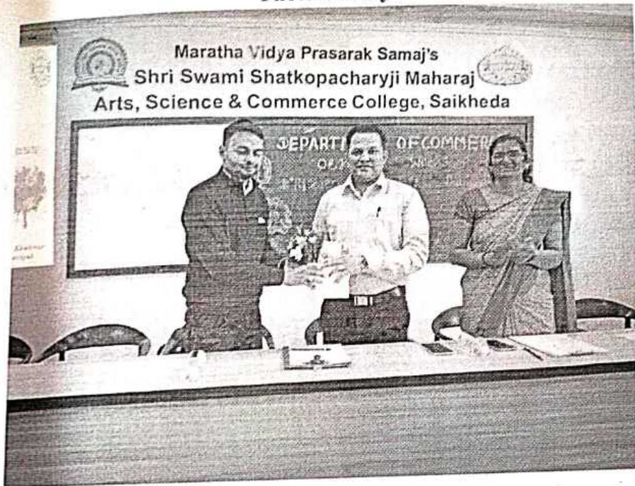
Welcome of Guest